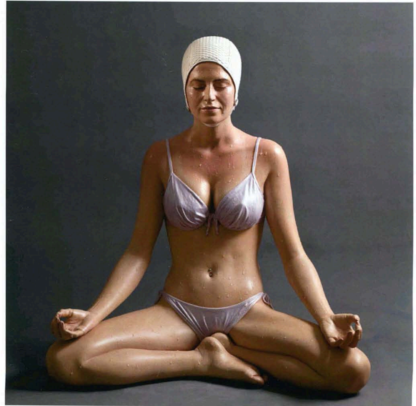
Balance 36 x 32 x 18 inches oil and resin, above.